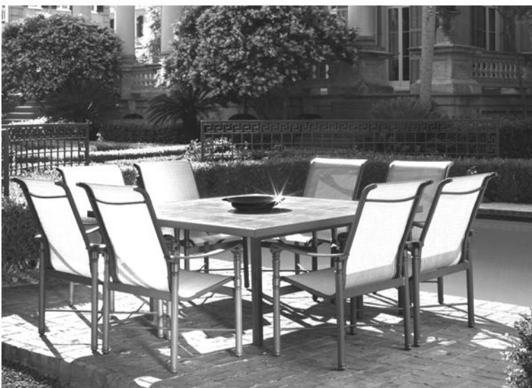
Elegant Dining Sets for 8.