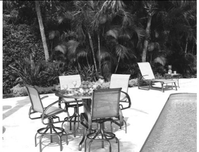
Counter & Bar Height Sets