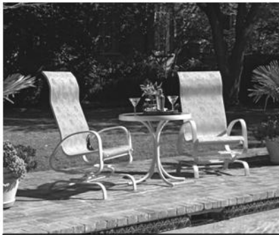
Casual seating for outdoors.