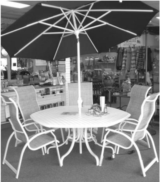
Hexagonal Table comfortably seats 6 for a fun day of eating crabs!