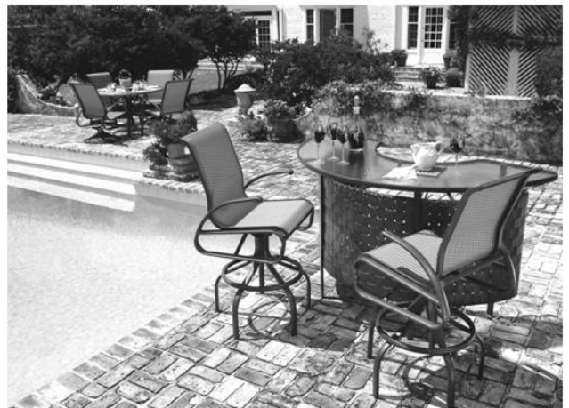
Coordinated Bar and Dining Sets