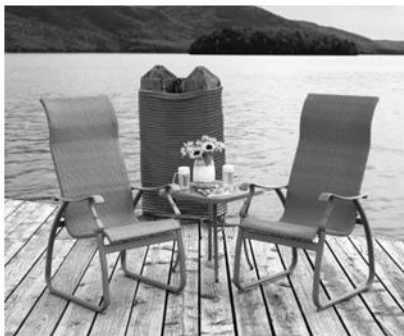
Made with pride In the USA!