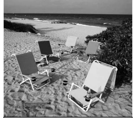
Beach Chairs in vibrant colors.