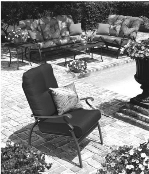
Casual seating for sunrooms or screened porches.